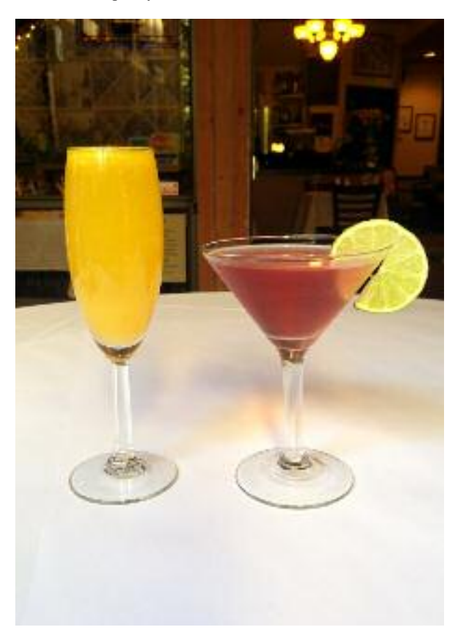
When: 2-5:30 pm, Monday-Sunday Where: 100 Lafayette Cir #101, Lafayette Drinks: $2 off all beer, wine and cocktails Recommended: $8 Cosmopolitan and $6 Fresh-squeezed Mimosa

Close the keyboard and put away your phone. Order yourself an afternoon mimosa or pre-dinner drink and take a trip back to the classic simplicity of cocktail hour.